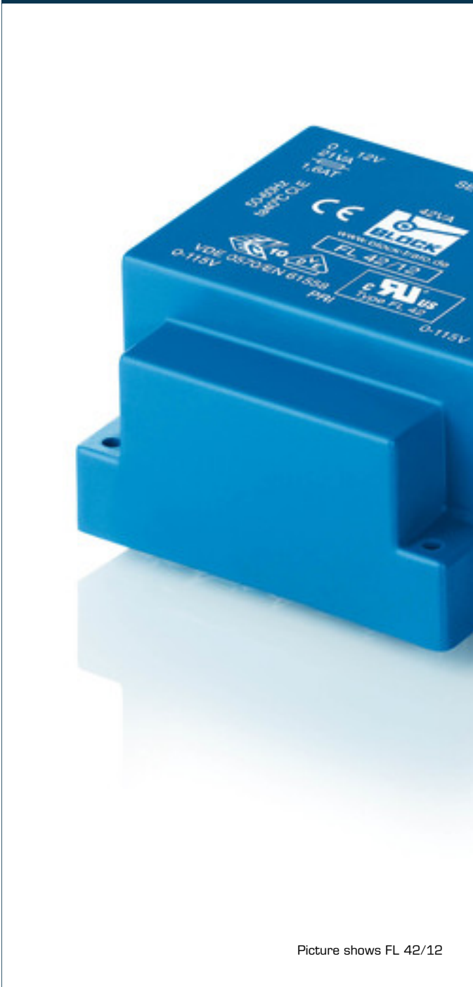
Picture shows FL 42/12