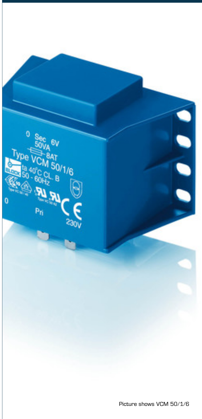
Picture shows VCM 50/1/6