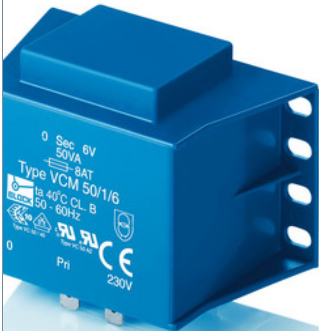
Picture shows VCM 50/1/6