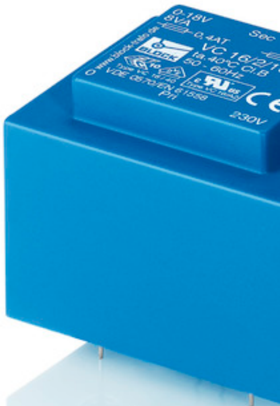
Picture shows VC 16/2/18