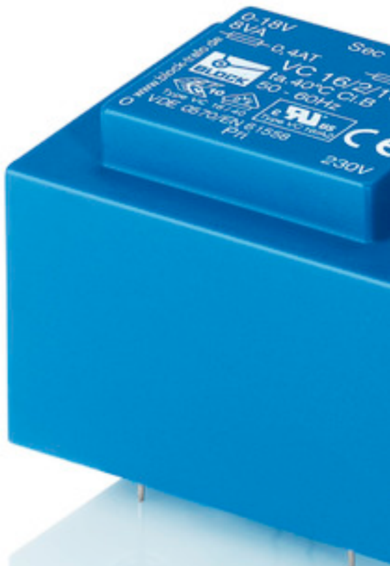
Picture shows VC 16/2/18