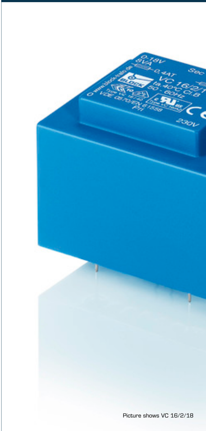
Picture shows VC 16/2/18