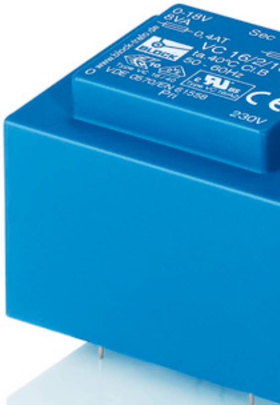
Picture shows VC 16/2/18