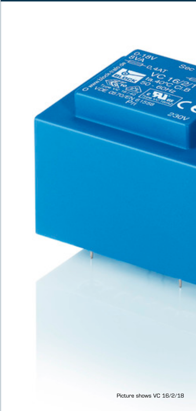
Picture shows VC 16/2/18