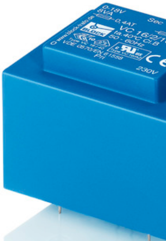
Picture shows VC 16/2/18