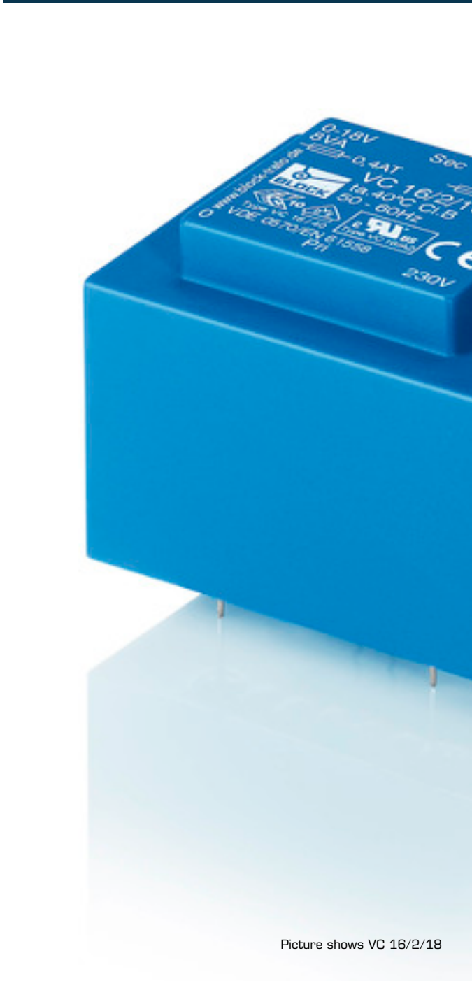
Picture shows VC 16/2/18