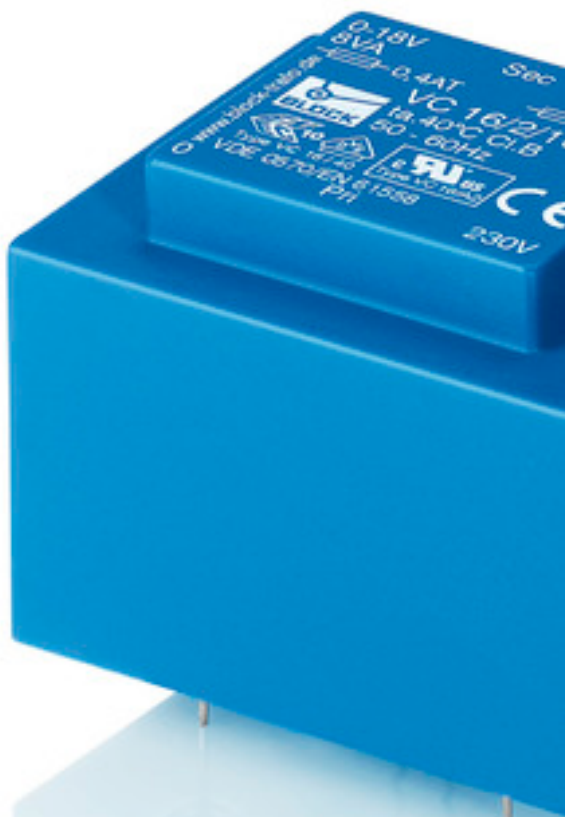
Picture shows VC 16/2/18