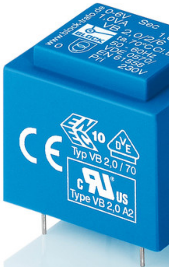
Picture shows VB 2,0/2/6