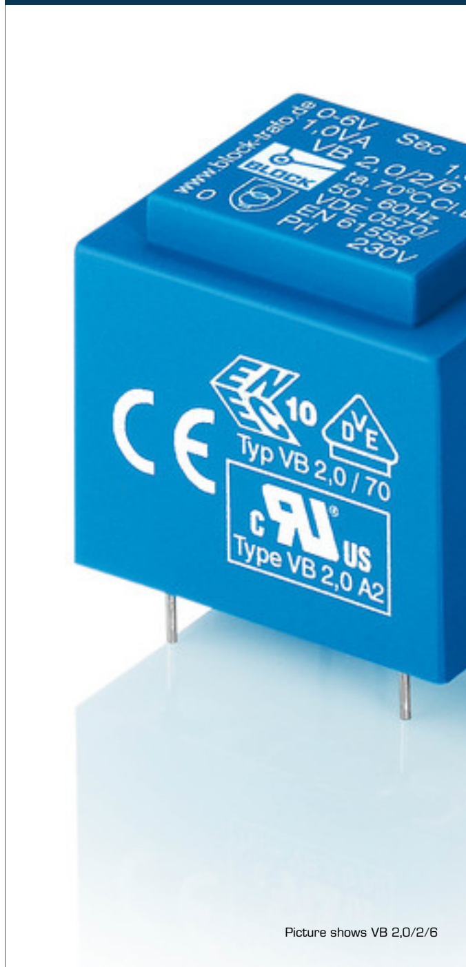
Picture shows VB 2,0/2/6