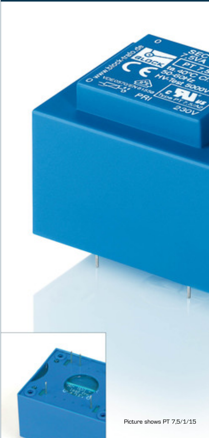
Picture shows PT 7,5/1/15