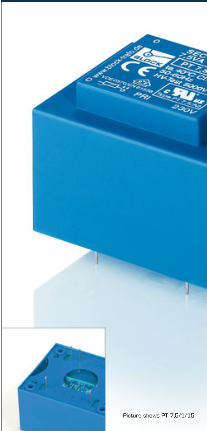
Picture shows PT 7,5/1/15