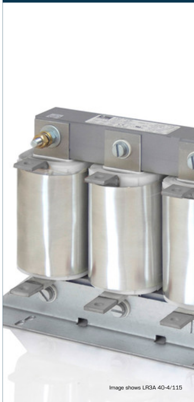
Image shows LR3A 40-4/115