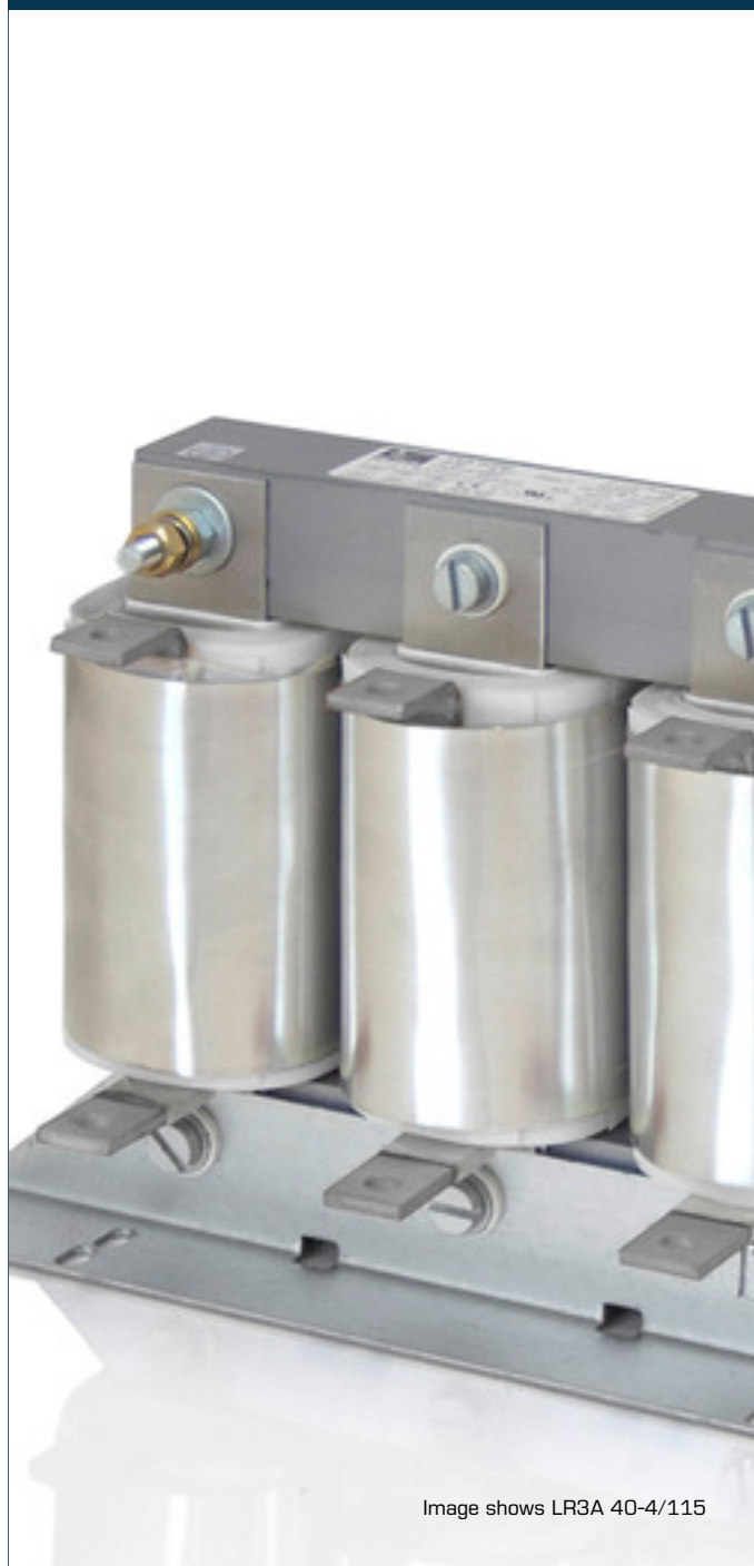
Image shows LR3A 40-4/115