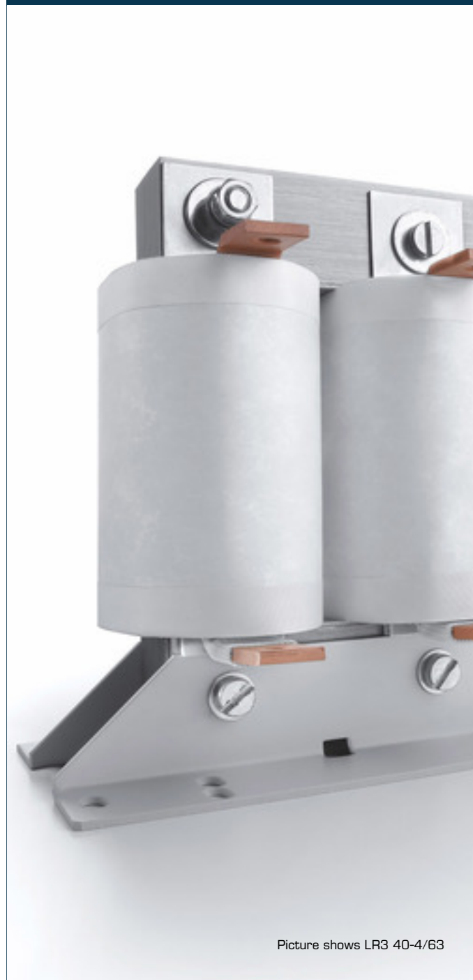
Picture shows LR3 40-4/63