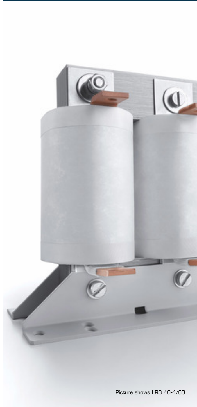
Picture shows LR3 40-4/63