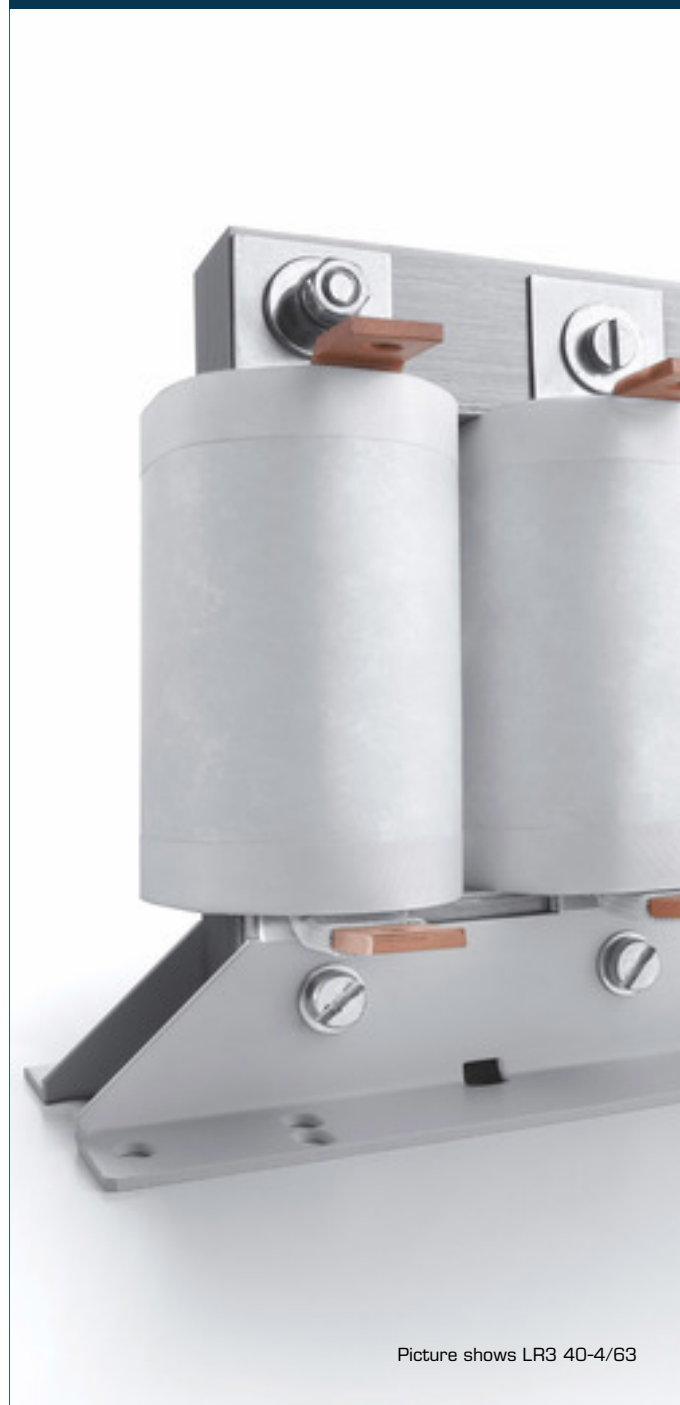
Picture shows LR3 40-4/63