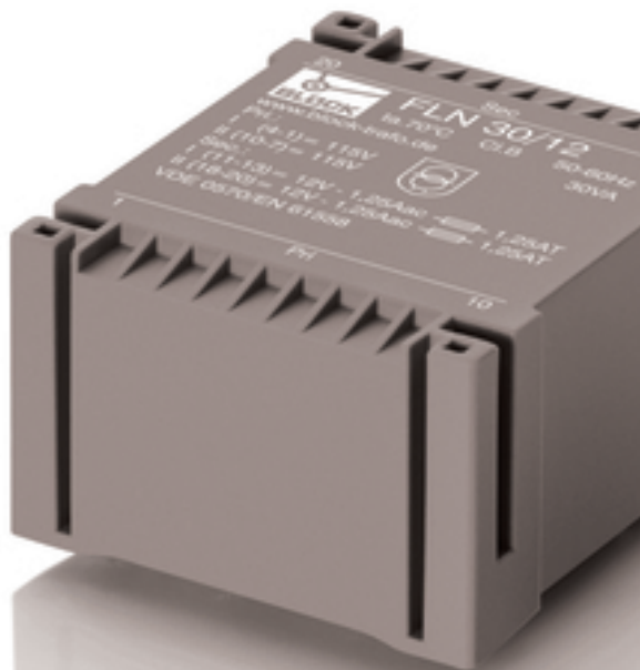
Picture shows FLN 30/12