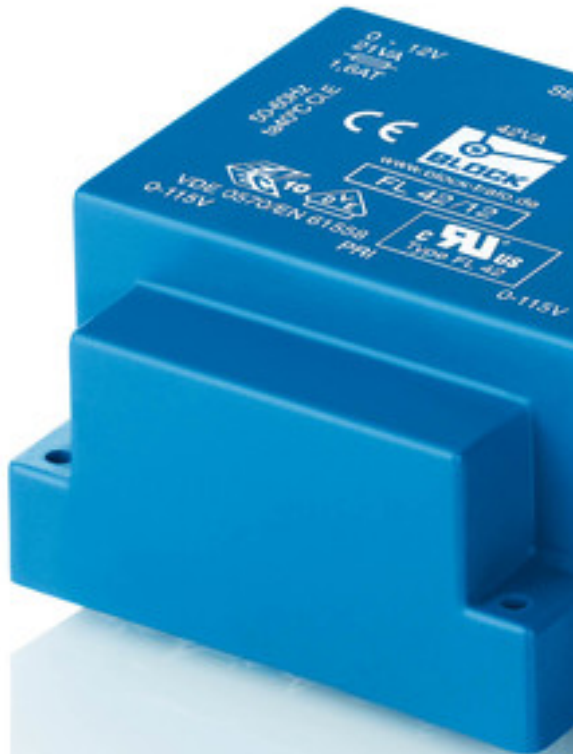
Picture shows FL 42/12