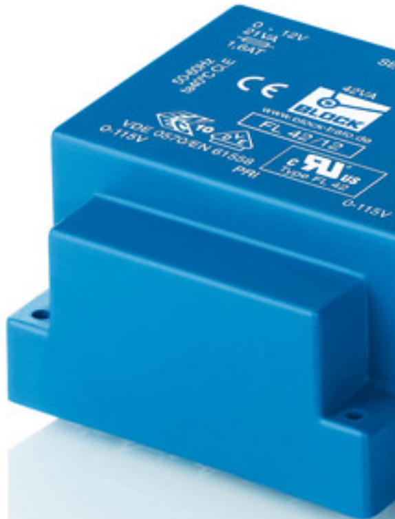
Picture shows FL 42/12