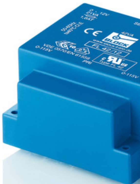
Picture shows FL 42/12