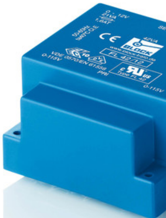
Picture shows FL 42/12