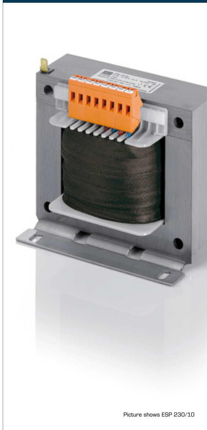
Picture shows ESP 230/10