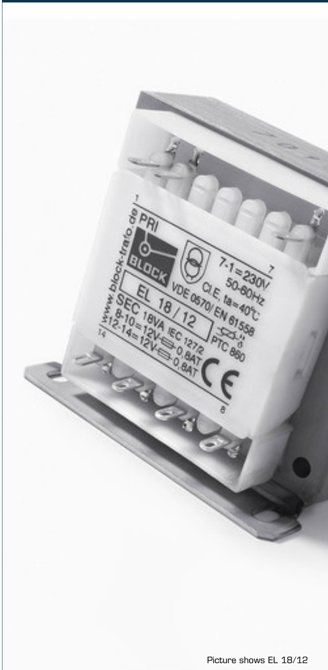
Picture shows EL 18/12