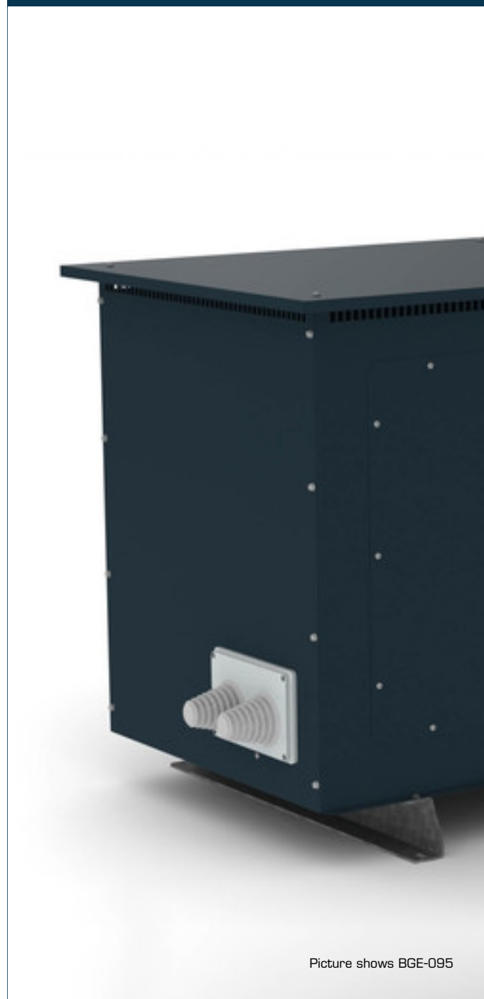
Picture shows BGE-095