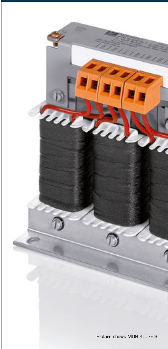
Picture shows MDB 400/6,3